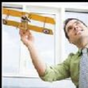
What my co-workers think I do