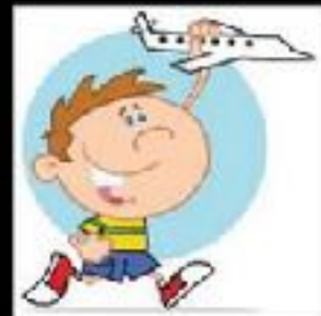
What my wife thinks I do