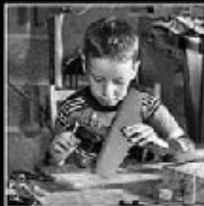
What my mom thinks I do